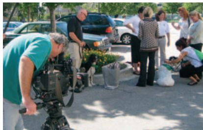
NBC filming volunteers outside National Teachers Academy

We know there are kids in need of reading help all across the country. Our dream is to bring Sit Stay Read programs to each and every one of them, helping more kids become lifelong readers. Right now we're gathering resources—information, people, money, skills—to make this